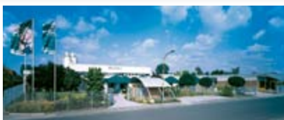
Silikal production and administration in Mainhausen, near Frankfurt/Main, Germany.