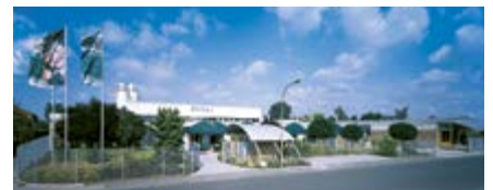
Silikal production and administration in Mainhausen, near Frankfurt/Main, Germany.

Our products comply with the Halal european guidelines